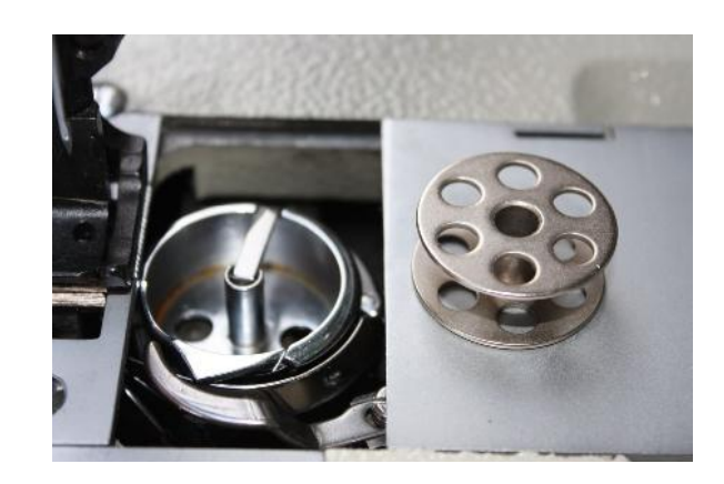
Large top Load Bobbin